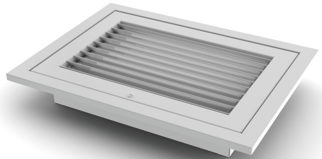
The 350RLF grille with the new Universal Filter Frame.

The new filter frame design is a substantial improvement over the previous design. The new design has the same dimensions (length, width, depth) for the type 1 and type 3 borders. Standardizing the dimensions for these two border types allows reps to stock only one model for both lay-in and surface mount applications for specific ceiling grid sizes. For example a 20" x 20" 350RLF can be used in surface mount applications and will also fit into a 24" x 24" ceiling grid for lay-in applications. In addition, the new design has a wider frame flange than the previous design. This allows for more forgiveness when covering up the wall or ceiling opening in surface mount applications. The narrow frame flange of our previous design also limited the type and size of the quarter turn fastener and receptacle that could be used for each model. The wider flange on our new design allows us to use a much higher quality quarter turn fastener and larger receptacle. Now, the fastener assembly is much